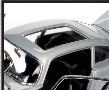
"DON'T TOUCH THAT BUTTON!" Removable escape hatch roof also allows 007 to eject his enemies