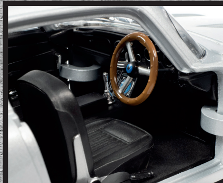
Doors open to reveal a lavish fully-detailed interior featuring full instrumentation